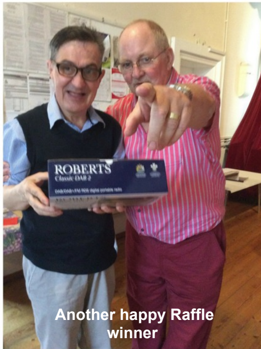
Another happy Raffle winner