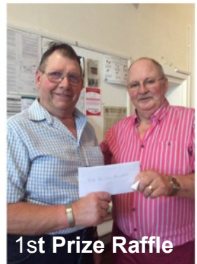
1st Prize Raffle